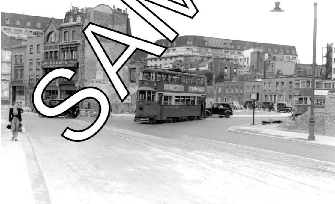
Significant lengths of new tram track were installed in 1950 for the gyratory traffic system which was constructed at the north end of Lambeth Palace Road in anticipation of the Festival of Britain. Here the new layout introduced on 11th June is followed by Feltham tram 2101 turning from the newly-constructed section of Addington Street to rejoin Westminster Bridge Road while heading for Purley on route 18.