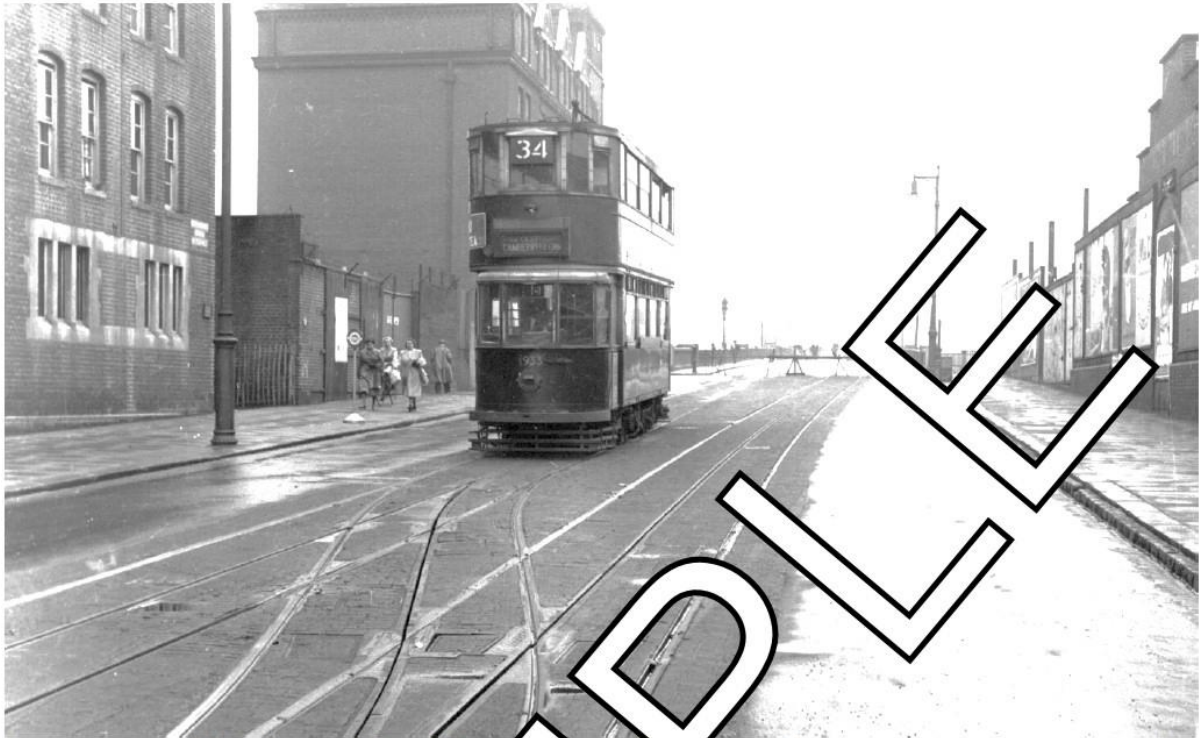
In the evening of 16th March 1950 a boat collided with Lambeth Bridge, causing damage such that the bridge had to be closed to road traffic for several months. In its final months tram route 34 was curtailed at the crossover on the south side of the bridge, as shown here with E/3 tram 1933.